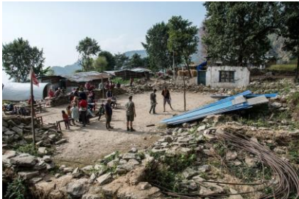
■ KASIN trustees surveying the site at Dhandakharka in November 2015

Much has happened over that year. No sooner had the dust settled from the earthquake when the blockade along the Indian Border resulted in crippling fuel and material shortages and led to a halt in the recovery processes. It was with this background that 4 of our Trustees flew to Nepal for our annual visit.