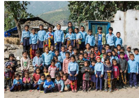
■ The children at Dhandakharka amidst the ruins of their school

The future of Nepal is in the hands of today's children