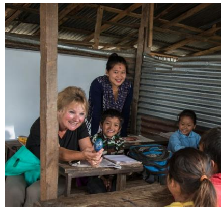
■ Helping to teach English at Dhandakharka

For the latest update on the situation in Nepal go to our website, visit our Kasin Charity Facebook page or @kasincharity on Twitter